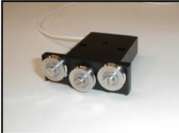
P/N FT3-7U-2000g Shown